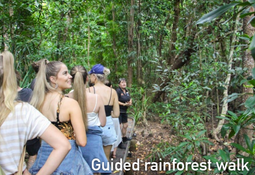
Guided rainforest walk