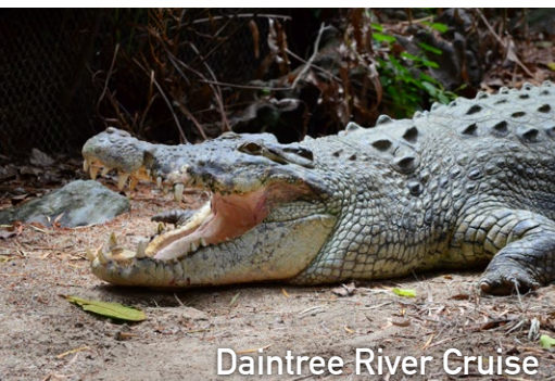
Daintree River Cruise