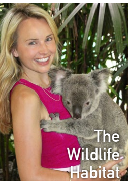
The Wildlife Habitat