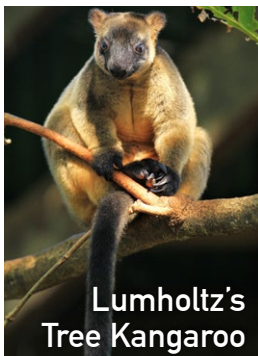
Lumholtz's Tree Kangaroo