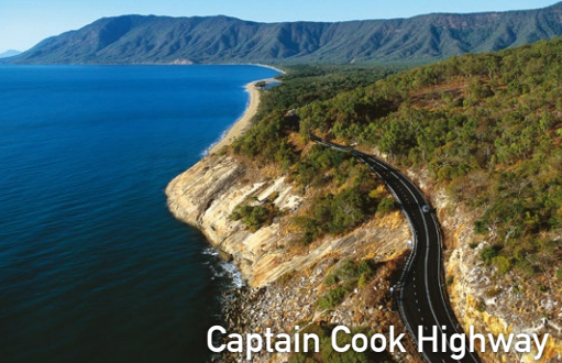
Captain Cook Highway