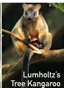
Lumholtz's Tree Kangaroo