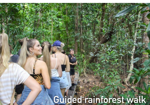
Guided rainforest walk