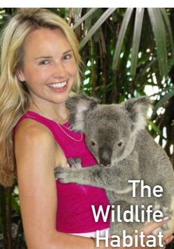
The Wildlife Habitat