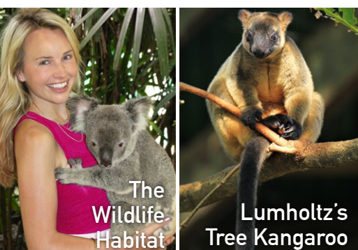
The Wildlife Habitat