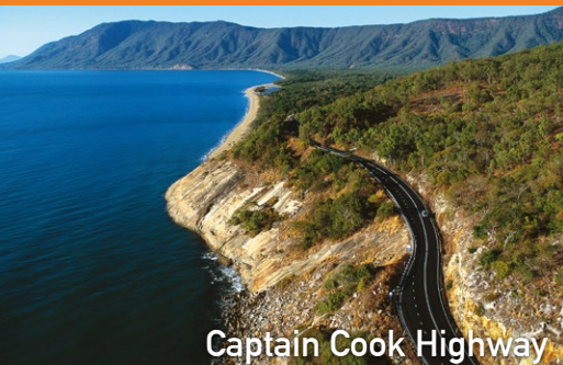
Captain Cook Highway